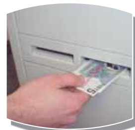
Fixed deposit EMS R2R2P4R5