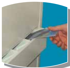
Extensible deposit EMS R2R2V4R5